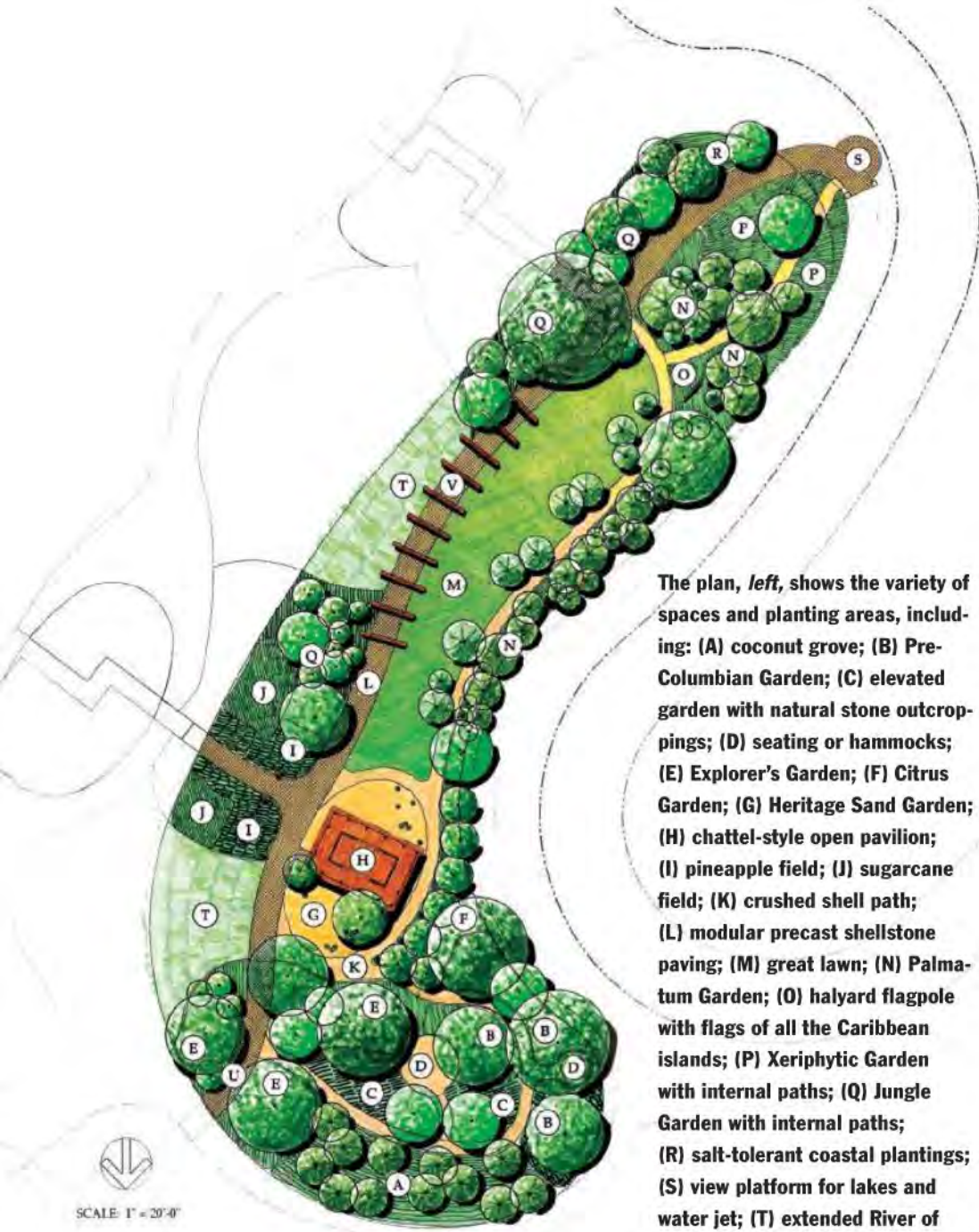
The plan, left, shows the variety of spaces and planting areas, including: (A) coconut grove; (B) Pre-Columbian Garden; (C) elevated garden with natural stone outcroppings; (D) seating or hammocks; (E) Explorer's Garden; (F) Citrus Garden; (G) Heritage Sand Garden; (H) chattel-style open pavilion; (I) pineapple field; (J) sugarcane field; (K) crushed shell path; (L) modular precast shellstone paving; (M) great lawn; (N) Palmtum Garden; (O) halyard flagpole with flags of all the Caribbean islands; (P) Xeriphytic Garden with internal paths; (Q) Jungle Garden with internal paths; (R) salt-tolerant coastal plantings; (S) view platform for lakes and water jet; (T) extended River of Grass Garden; (U) coral stone columns at all entry points; and (V) vine-covered pergola.

a steel drum visitors can play and signs that talk about the movement of plants through the Caribbean as Europeans first explored the Americas. (The signs are based on research by Truskowski's firm but were designed by others.)