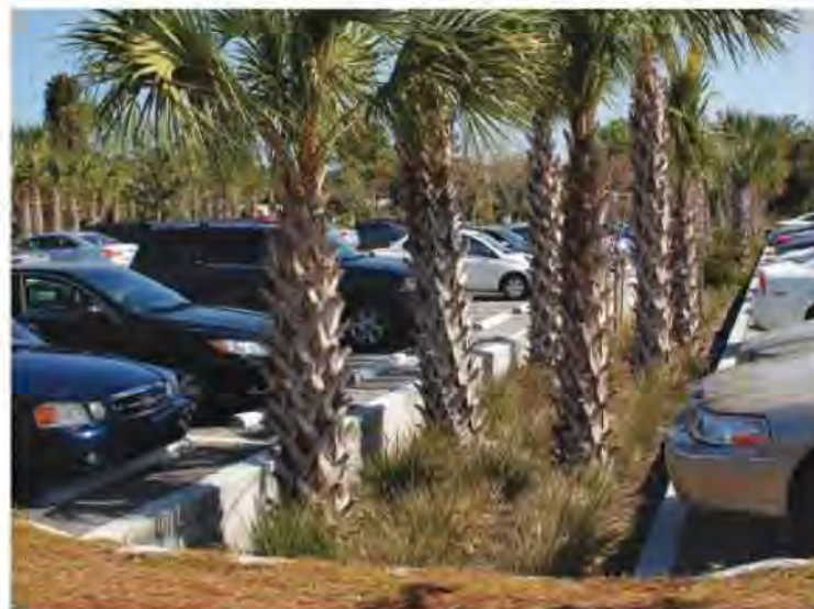
A birding tower by LakelFlato Architects, opposite , provides a place to survey the native landscape, which was once overrun by melaleuca. Both wetland and upland habitats were restored and are being managed to discourage such invasive species from taking them over in the future. The parking lot drains into a series of bioswales, above , which then flow into a larger rain garden.

Meanwhile, the opening of the Florida Garden later this year will make an important statement by showing locals that a natural preserve isn't the only place where Florida natives can shine. Small, residential scale gardens will demonstrate how home owners can integrate natives into their own properties. They'll be able to see that there's more to gardening than the "Mediterranean BS."