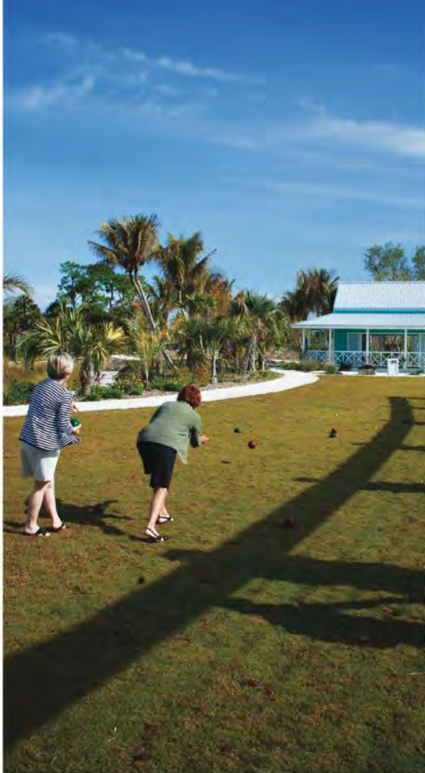
The Caribbean Garden encourages visitors to feel at home. Two women take advantage of the lawn area for a game of bocce, above . A pavilion patterned after a chattel house, at the right end of the section below , provides a focal point and a place to escape the rain. The plants used in the garden help tell the story of the Columbian Exchange, opposite .