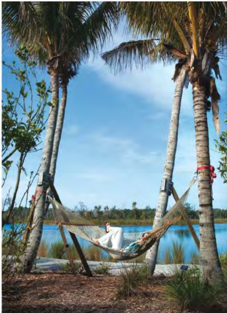
The Naples Botanical Garden strives to be a “world-class paradise.” In addition to its garden for children, there are hammocks, above , drums, and a game lawn. Days are set aside for artists, below right , for people to bring their dogs, below , and for events such as a large bonfire to celebrate the winter solstice.